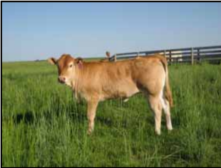
No Photo Contest winner this issue.