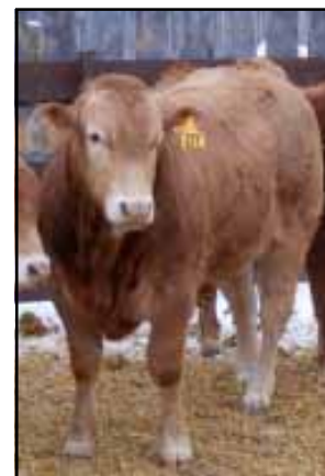
RHEO Ribeye Man 547R