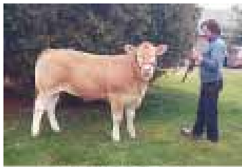
16 month old heifer - Sire: Duke