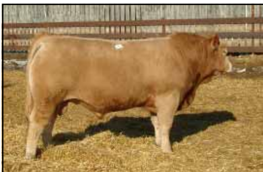
Blue Diamond Ringer ARI 38R

High-gaining Blonde bull in the 2005 - 2006 test for yearling bulls at the Test Station at Douglas, Manitoba was Blue Diamond Ringer ARI 38R from the Blue Diamond Blonde herd (average daily gain of 4.61 lbs per day). Ringer was purchased by Andy McKay of Thunder Creek Blondes at Kelfield, Saskatchewan for $3,650.